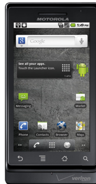
Droid by Motorola